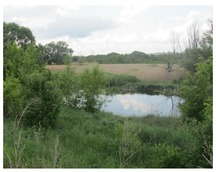
Figure 3 . Crinitsa «Homonovo» in the village of Golofeyevka is a large spring funnel.

The spring in the village of Golofeevka can serve as the confirmation of the last statement (Figure 3).