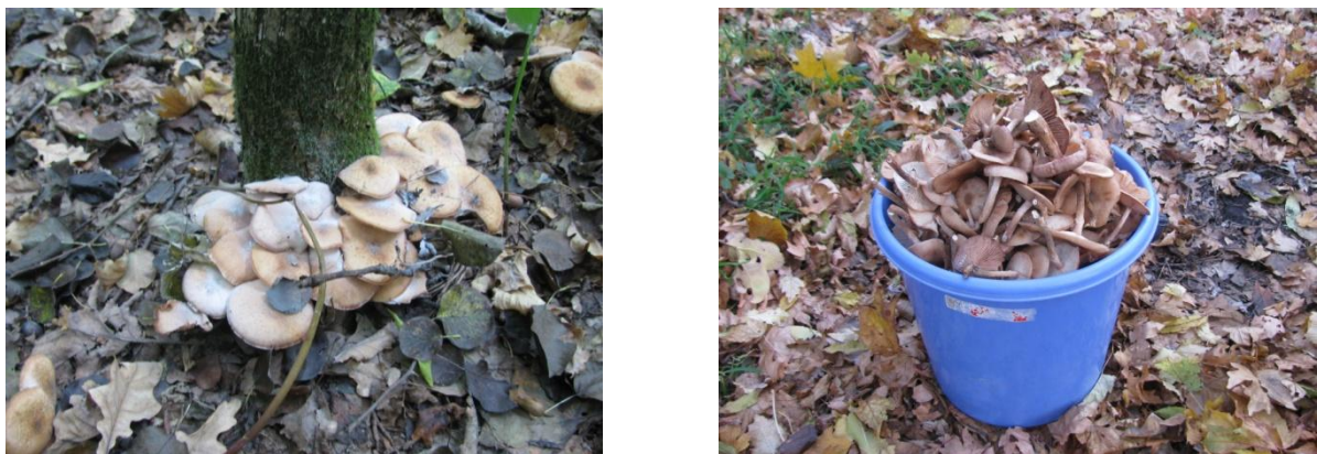
Fig. 2: Fruit bodies of honey fungi A. mellea s. l. of ecomorphotype #2. a) at the foot of a dead aspen b) gathered in a bucket

The next identification stage is detection of belonging of each of two local ecomorphotypes to a certain species: A. cepistipes or A. Gallica according to colour and form of cap, stipe, size and concentration of squames on fruit bodies' caps [4].