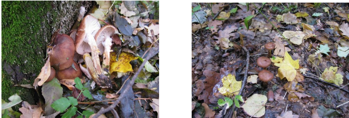
Fig. 1: Fruit bodies of honey fungi A. mellea s. l. of ecomorphotype #1. a) at the foot of a living oak b) in soil with underground trees remains

we should see that both of them belong to the grouping of species A. cepistipes – A. gallica . This conviction is reinforced also by the result of rhizomorphs macrostructure comparison: rhizomorphs of local ecomorphotypes (see table 1) and representants of A. cepistipes – A. gallica [4, 7, 9] are characterized by monopodial ramification. As for geographical information about expansion of A. cepistipes and A. gallica , it is known that these species are found everywhere, both in Western and Eastern Europe, including Belarus, Ukraine and Russia [3], and also in Siberia [4]. Besides, A. gallica was exactly identified in oakeries of Voronezh region [3], which share borders with Belgorod region. Thus, there is no doubt that ecomorphotypes we investigate (see table 1) belong to A. cepistipes – A. gallica .